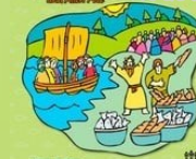
Table for five... Thousand!

One Worship Service at 10:00 am Continental Breakfast at 9:15